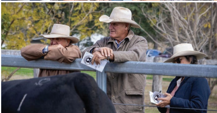
Photography for 2025 Marcella Bull Sale courtesy of CPB Livestock